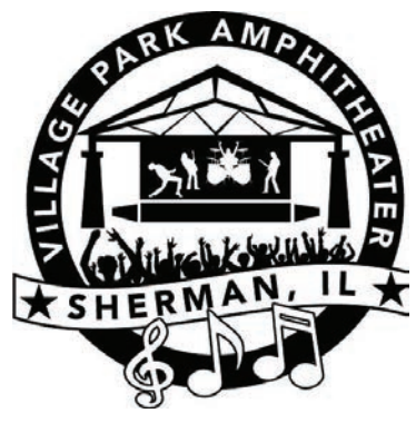
Check out our new event series logo!