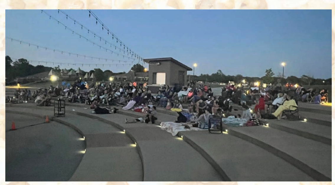
The first Movie in the Park – Jungle Cruise – drew families to Village Park in early June. Don't miss the rest!